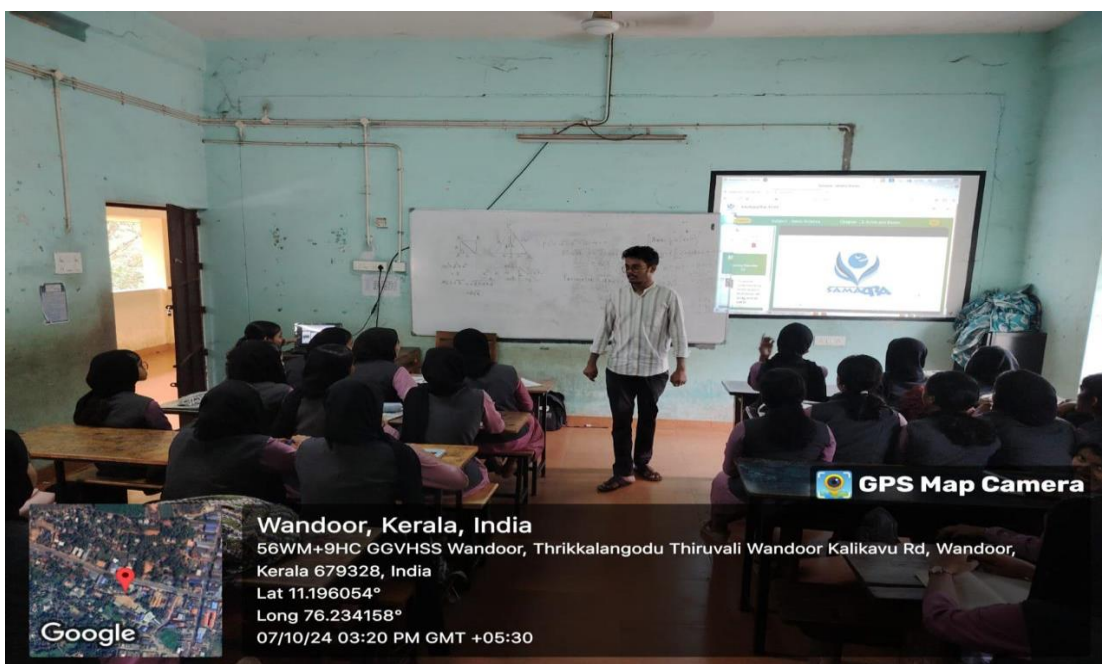
Class with Samagra